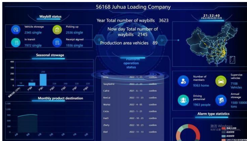
Figure 3-1 56168 logistics distribution digital intelligent control platform

56168 logistics distribution digital intelligent control platform is a full-sense control platform containing software, hardware and algorithms. As shown in Figure 3-1, the 56168 logistics distribution digital intelligent control platform contains the real-time status of waybills, quarterly distribution of major products, monthly product going map, annual product going map, total number of yearly waybills, total number of today's waybills, factory vehicles, platform operation status, alarm type statistics, number of members, supervised vehicles, annual distribution, driving personnel, route specificity and other functions. It reduces the difficulty of operation for operators and improves the fun of operation.