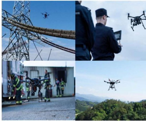
Figure 1. Rotary drone application scenarios

The purpose of this paper is to review and analyse the trajectory tracking control technology of rotary-wing UAVs. Firstly, it introduces the common dynamics modelling of rotary-wing UAVs, and then systematically combs through the existing trajectory tracking control methods, which mainly include linear control and nonlinear control and other techniques, and evaluates and compares the merits and demerits of various methods. Finally, numerical simulation of the common linear control technique PID control as well as its improvement method is carried out, and then the flight experiment hardware platform is introduced. Through the review of this paper, it aims to provide reference and reference for the research and application of trajectory tracking control technology of rotary-wing UAVs.